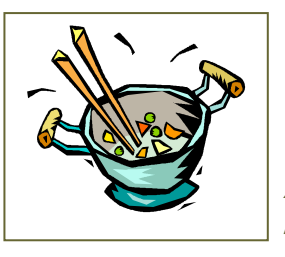
A caption is a sentence describing a picture or graphic.

You can have an article go from one page to another by using linked text boxes. Everything in this newsletter template is contained in a series of text boxes. These words are contained in a text box, as is the graphic on this page, with its caption in yet another. A text box offers a flexible way of displaying text and graphics; it's basically a container. You can move a text box around, positioning it just where you want it; you can resize it into a tall narrow column or into a short wide column, or even rotate it so that the text reads sideways. By linking a text box on one page with a